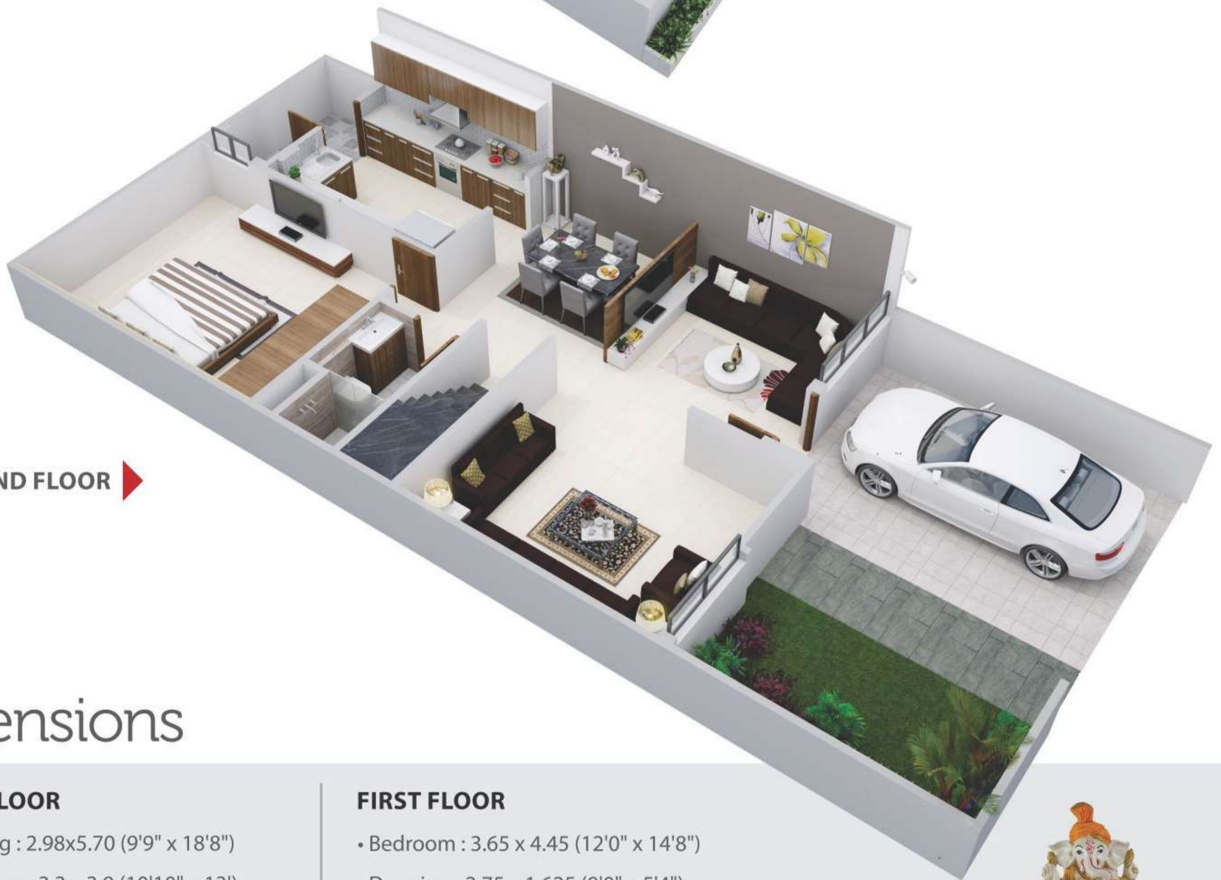
GROUND FLOOR ▶