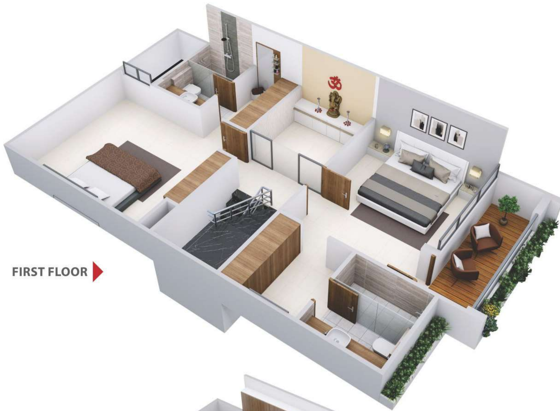
FIRST FLOOR ▶